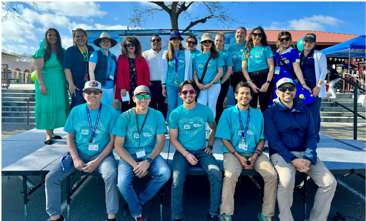
San Ysidro School District Sci-Phy Team